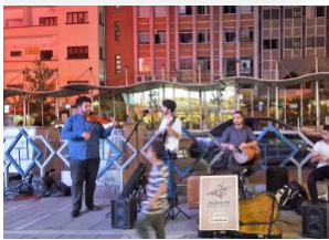
A band performing at a central crossroad in Tehran