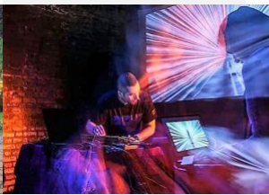
Electronic music performance