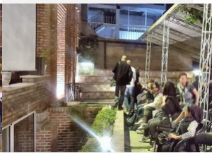
Open-air film screening in a Café