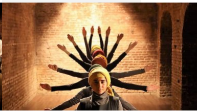
Modern Dance and Acting