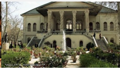
The Cinema Museum in Northern Tehran