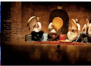
Four musicians performing on the Daf