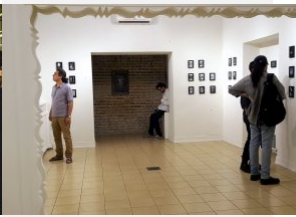
Photo exhibition in a gallery