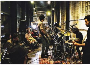
A band performing in one of Tehran's modern Cafés