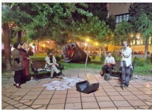
Tehran's Artists' Park offers cultural attractions both day and night