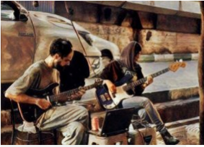
Musicians performing in the streets of Tehran

We are happy to help you organize your return journey to the airport.