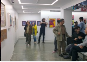
Vernissage in a private art gallery