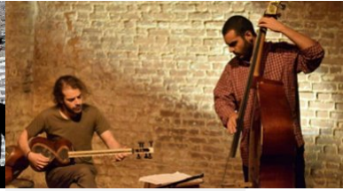
Two artists performing on the Tar and Double Bass