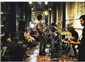
A band performing in one of Tehrans modern Cafés