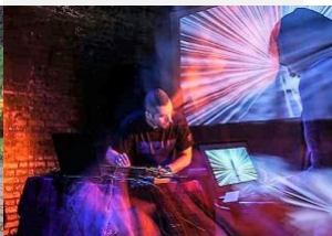
Electronic music performance