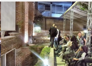
Open-air film screening in a Café