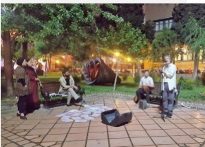
Tehran's Artists' Park offers cultural attractions both day and night