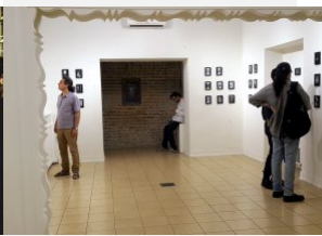
Photo exhibition in a gallery