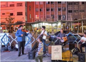
A band performing at a central crossroad in Tehran