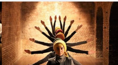
Modern Dance and Acting