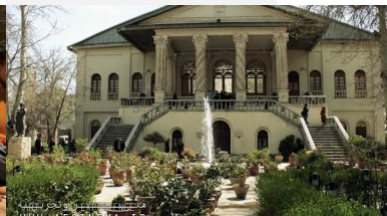
The Cinema Museum in Northern Tehran