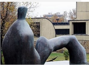
Tehran Museum of Contemporary Art