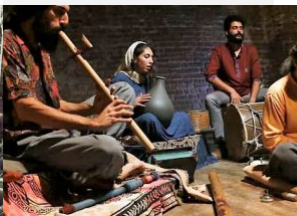
Experimental music performance