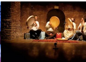
Four musicians performing on the Daf